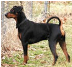
Natural Ears and Tail

COLOR: German Pinschers can be black & tan, shades of red, fawn and rarely blue & tan.